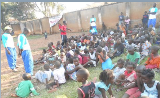
Organizing games for children at Kawempe slum; GSSM students standing by ready to help.