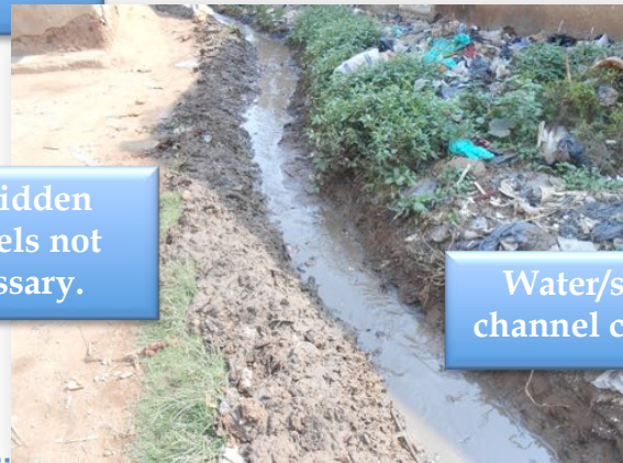
Water/ sewer channel cleared!