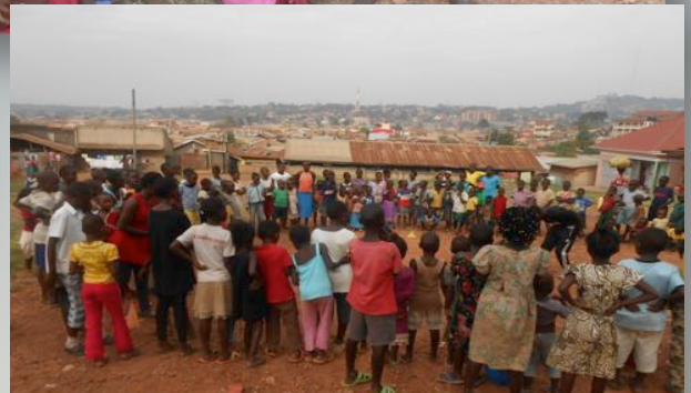
Kids Games (games that teach biblical principles at Kamwokya slum.