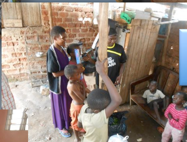
This slum family received both a Family Pack & Kids Kit