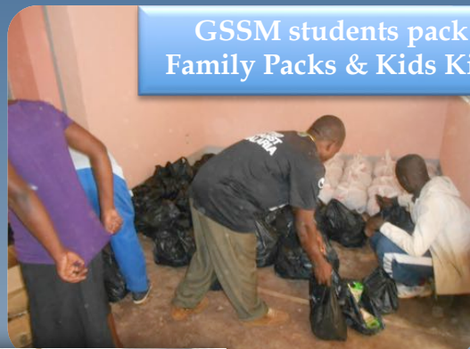
GSSM students pack Family Packs & Kids Kits

Christmas Family Packs consist of matoke, meat, sugar, salt, soap, ground nuts and other staples. Kids Kits contain clothes, shoes, sweets (candy) and a small toy.