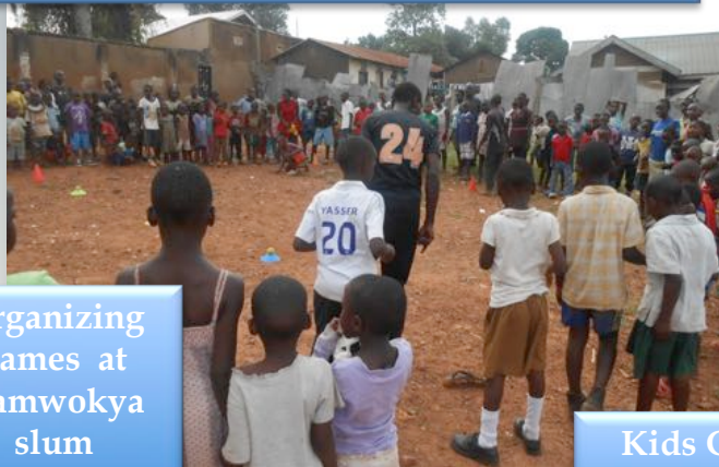
Organizing games at Kamwokya slum