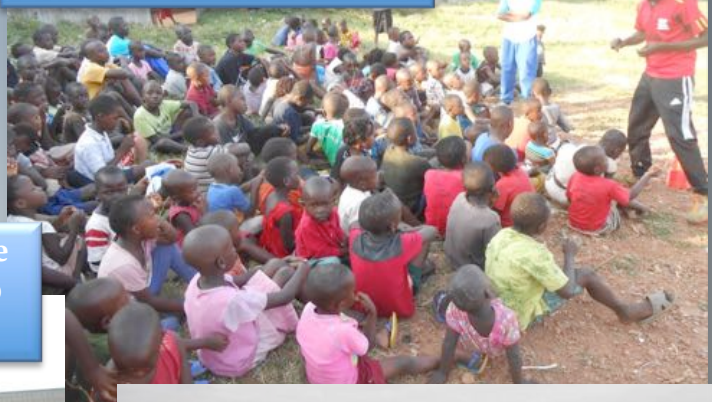
Sharing the Good News - Kawempe slum