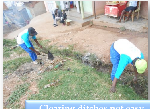
Clearing ditches not easy.