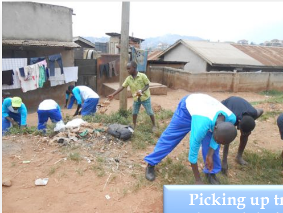
Picking up trash, clearing clogged drainage ditches; children