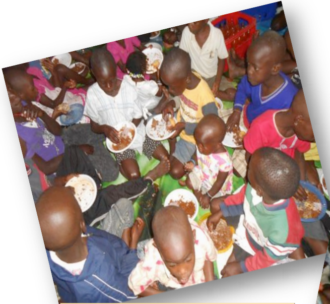
Children enjoying a meal at the Christmas party

Children rarely get soft drinks...but celebrating Christmas was special